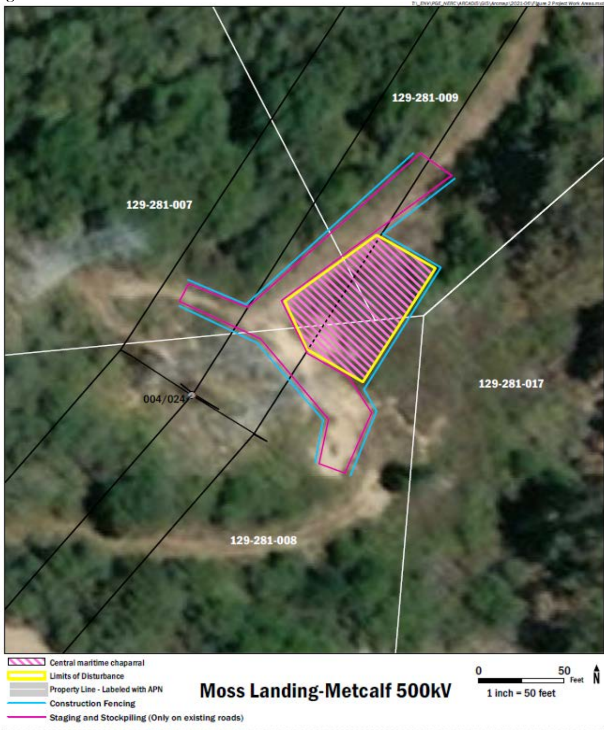
Figure 3. Limits of Disturbance

The site is not within an area of high archaeological sensitivity. Therefore, an archeological report was not required in relation to this project. The project proposal was presented to the OCEN for review and comment and the tribal representative did not request any conditions.