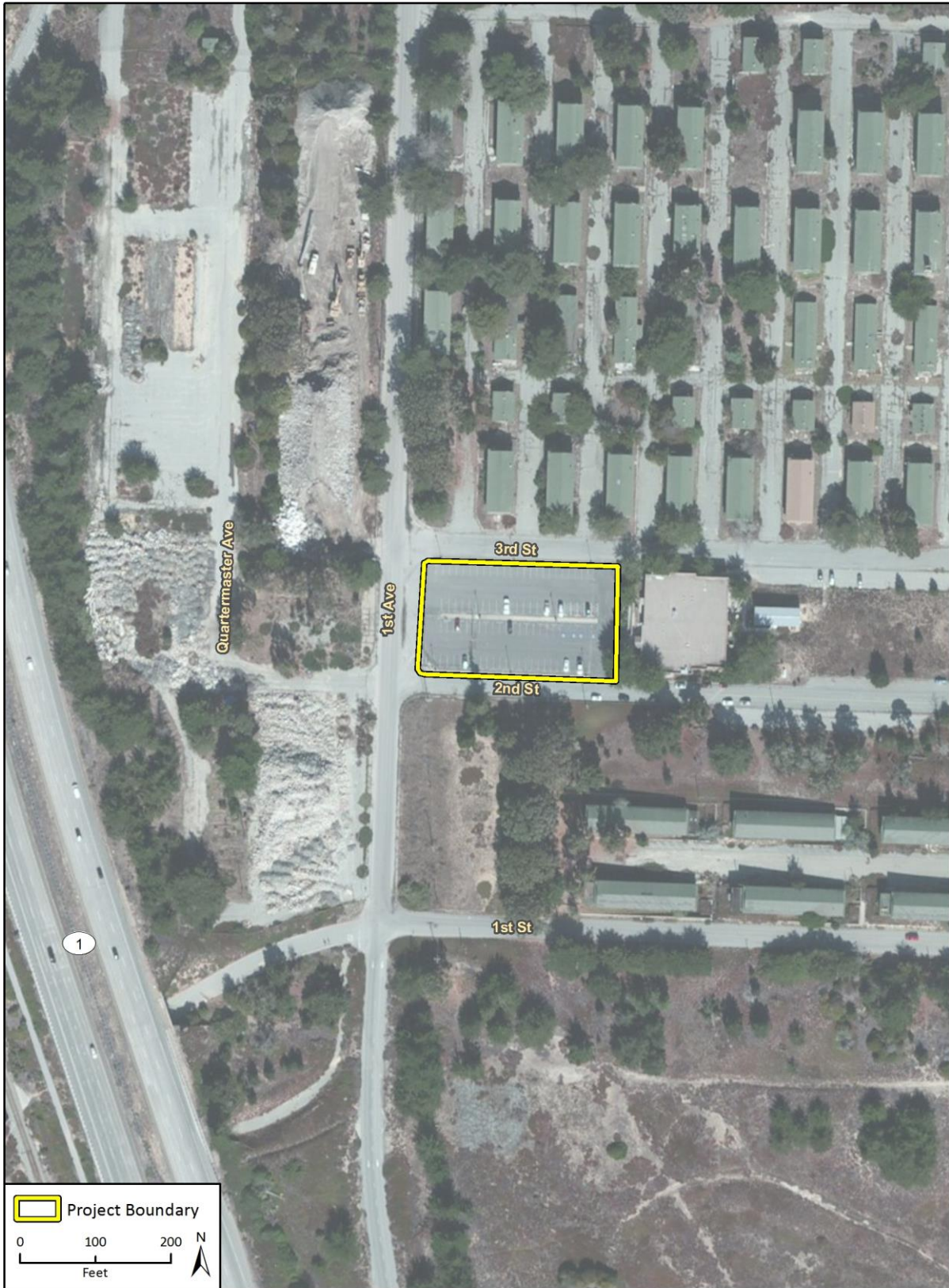
Figure 2 Project Site