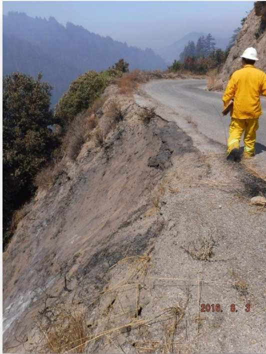
Damaged Road Slope