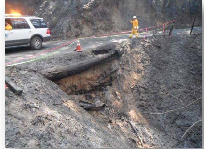
Burnt Retaining Wall