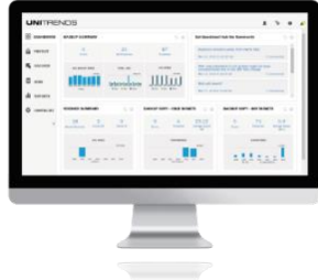
Management from a single pane of glass