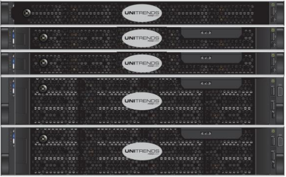
Optional: 10Gb SFP+ & 8Gb Fibre Channel HBA