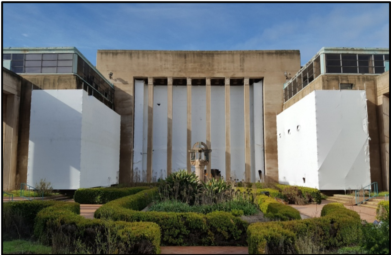
MCGC East & West Wings Renovation