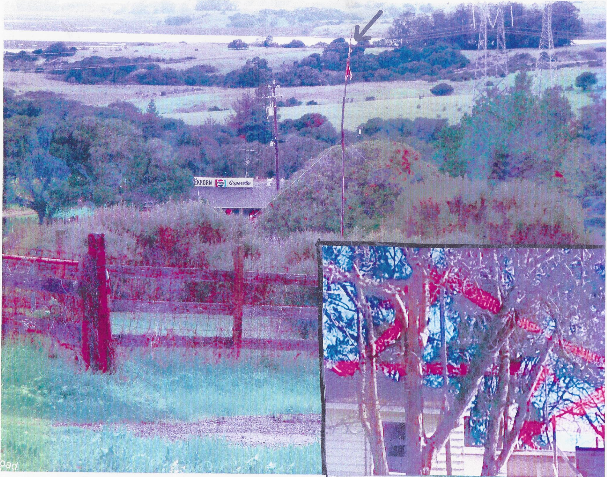
Submitted at NCCLUAC meeting on 12/16/14