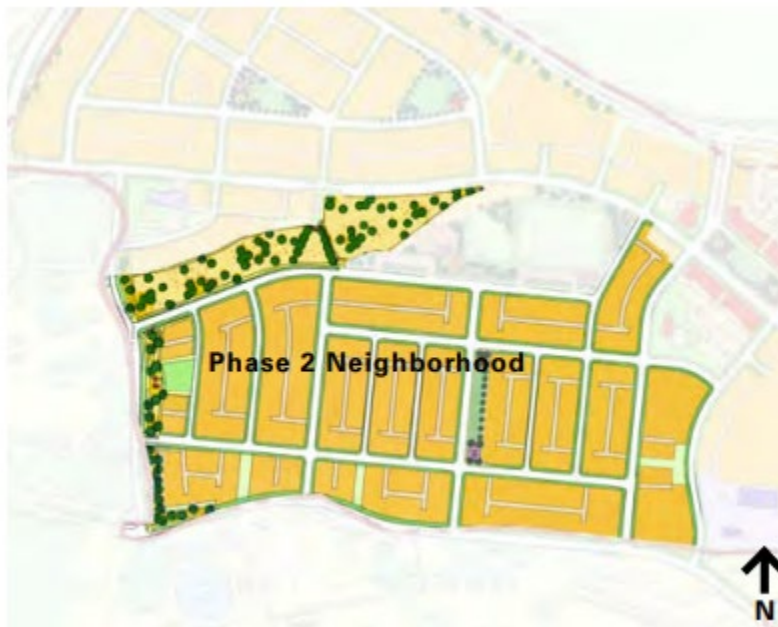
Figure 2. Existing Phase 2

Phase 2 included the development of 73 acres. This phase also included a mix of detached, single-family attached, and multi-family attached residential units. Phase 2, as approved, included the development of 471 residential units, though only 470 units were constructed. Phase 2 also included 9.2-acres of open space, 23.1-acres of roadways, pathways, and bicycle systems and 4.1-acres of parks.