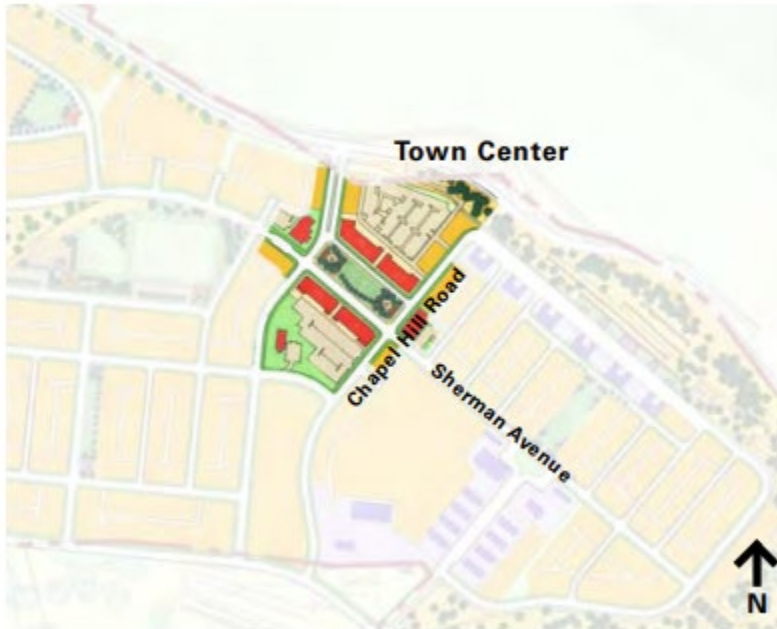
Figure 4. Existing Town Center Area