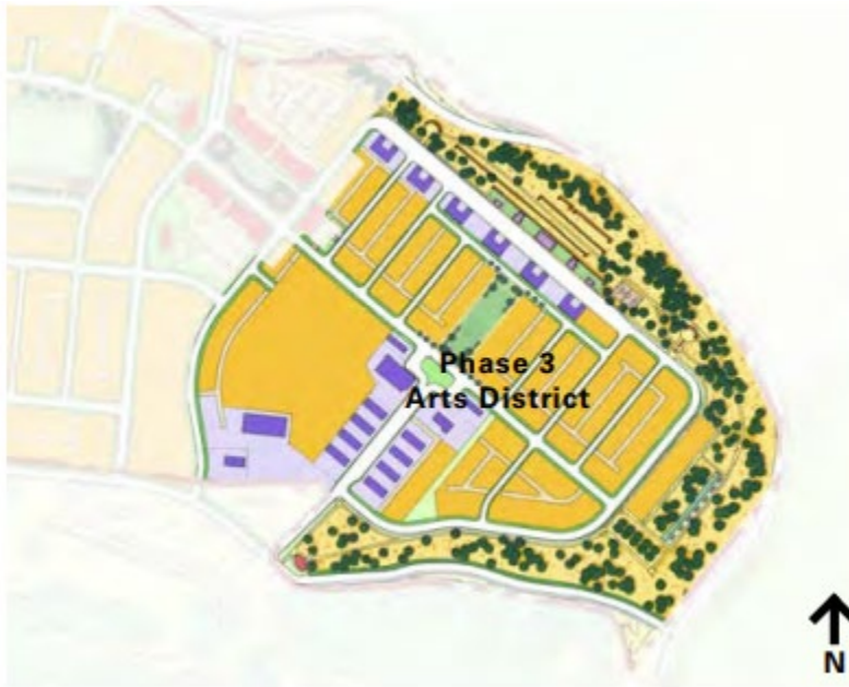
Figure 3. Existing Phase 3

Phase 3 included the development of 82 acres and included the Arts District. Phase 3 included residential uses, including 65 deed-restricted residences, adjacent to the Arts Park. Phase 3, as approved, included the development of 442 residential units, though only 192 units have been constructed. Phase 3 also included the rehabilitation and reuse of 25 historic structures, 11.1-acres of open space, 3.8-acres of parks, and 18.5-acres of roadways, pathways, and bicycle systems.