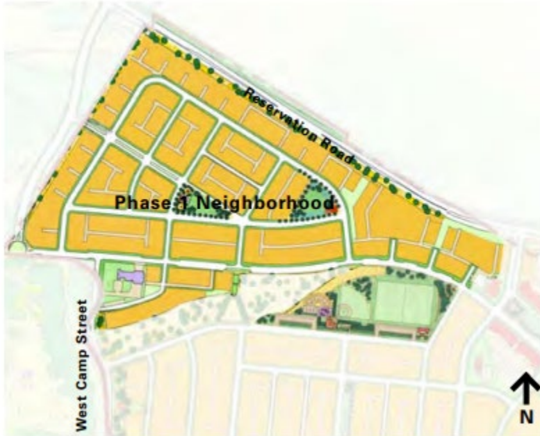
Figure 1. Existing Phase 1