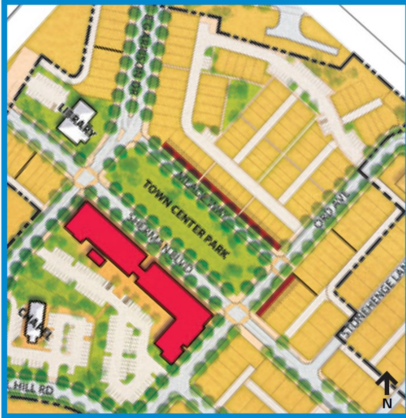
Figure 5. Proposed Project Area