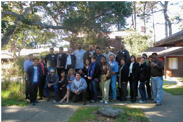
SILVER STAR RESOURCE CENTER STAFF

The Silver Star Resource Center is dedicated to working collaboratively to provide services for youth and their families to increase opportunities for academic achievement, attainment of employment skills, and to reduce risk factors in order to present positive youth development.