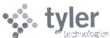
Exhibit A Investment Summary

The following Investment Summary details the software and services to be delivered by us to you under the Agreement. This Investment Summary is effective as of the Effective Date. Capitalized terms not otherwise defined will have the meaning assigned to such terms in the Agreement.