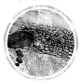
MOBILITY & ACCESS