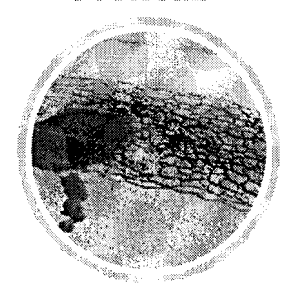
MOBILITY & ACCESS