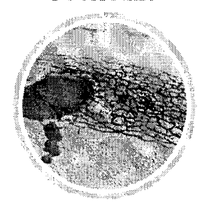
MOBILITY & ACCESS