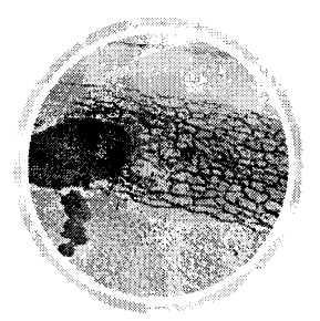
MOBILITY & ACCESS