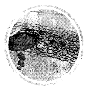
MOBILITY & ACCESS