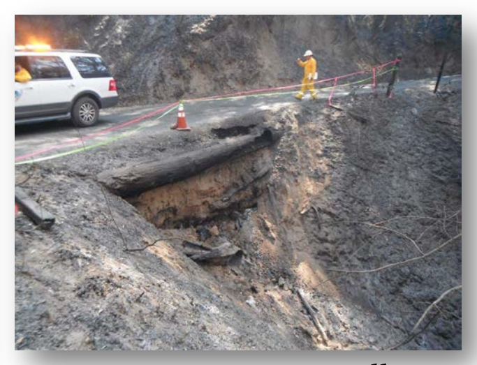
Burnt Retaining Wall