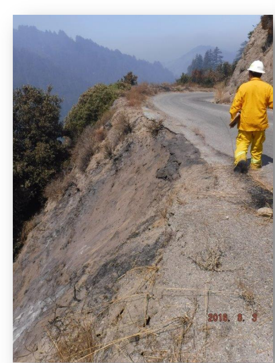
Damaged Road Slope