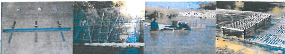
Figure A-1. Photos of a section of substrate rail prior to installation (left), rigid weir installed in the Stanislaus River (left-center), technicians installing a resistance weir panel (right center), and modified fish passage resistance panel.

Typically, a portable resistance board weir and Riverwatcher requires two days to install and can be removed in one day. A Weir is composed of four main components: a substrate rail, rigid weir, resistance weir, and modified fish passage resistance panel (Figure A-1). Refer to Cuthbert (2012) for detailed installation instructions; whereby, this particular installation requires skilled technicians that are SCUBA certified with experience using air tools in an aquatic environment due to the very poor visibility caused by high turbidity levels in the Salinas River. SCUBA divers essentially have to install the substrate rail without sight.