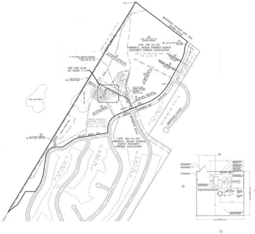
Figure 2. Location and Proposed Site Plan

The proposed facility would be contained within a 1,120-square foot leased area surrounded by an 8-foot tall fenced security enclosure; consisting of a 34-foot tall monopole designed to visually resemble a eucalyptus tree, an equipment shelter, electric meter, and a 30-kilowatt standby diesel generator ( Figures 2 and 3 ).