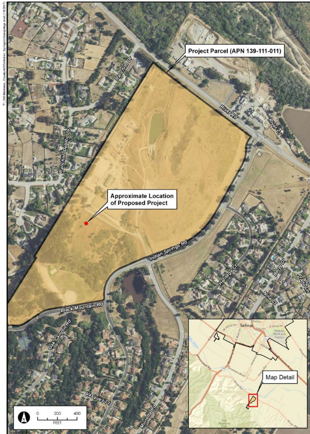
Figure 1. Parcel Map and Proposed Project Site Location

The proposed project consists of construction and operation of a wireless telecommunication facility on a vacant parcel (APN 139-111-011-000) within the Indian Springs Subdivision off River Road in Salinas, California ( Figure 1 ).