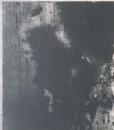
Presidio Curve Blasted

The voters had been asking for a new school building for a long time, and the school district had been refusing to build one.