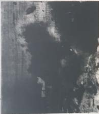
Presidio Curve Blasted

The voters of Pacific Grove had to vote on the school district's request for a bond issue to build a new high school. The voters of Pacific Grove had to vote on the school district's request for a bond issue to build a new high school.