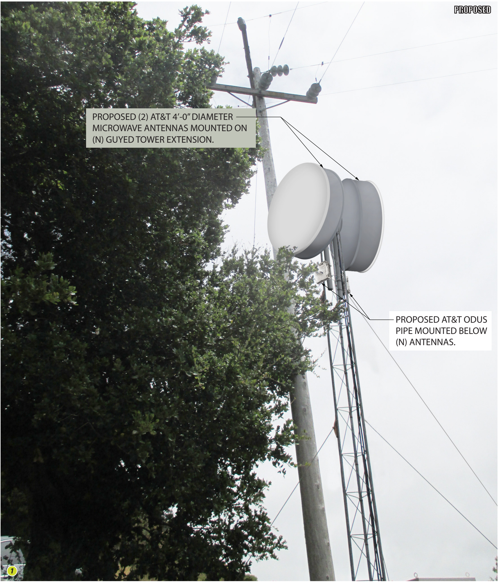
Photosimulation of proposed telecommunications site