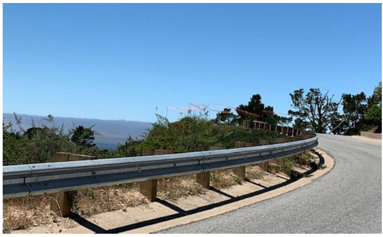
Figure 10 – Revised Staking and Flagging, view from Outlook Drive