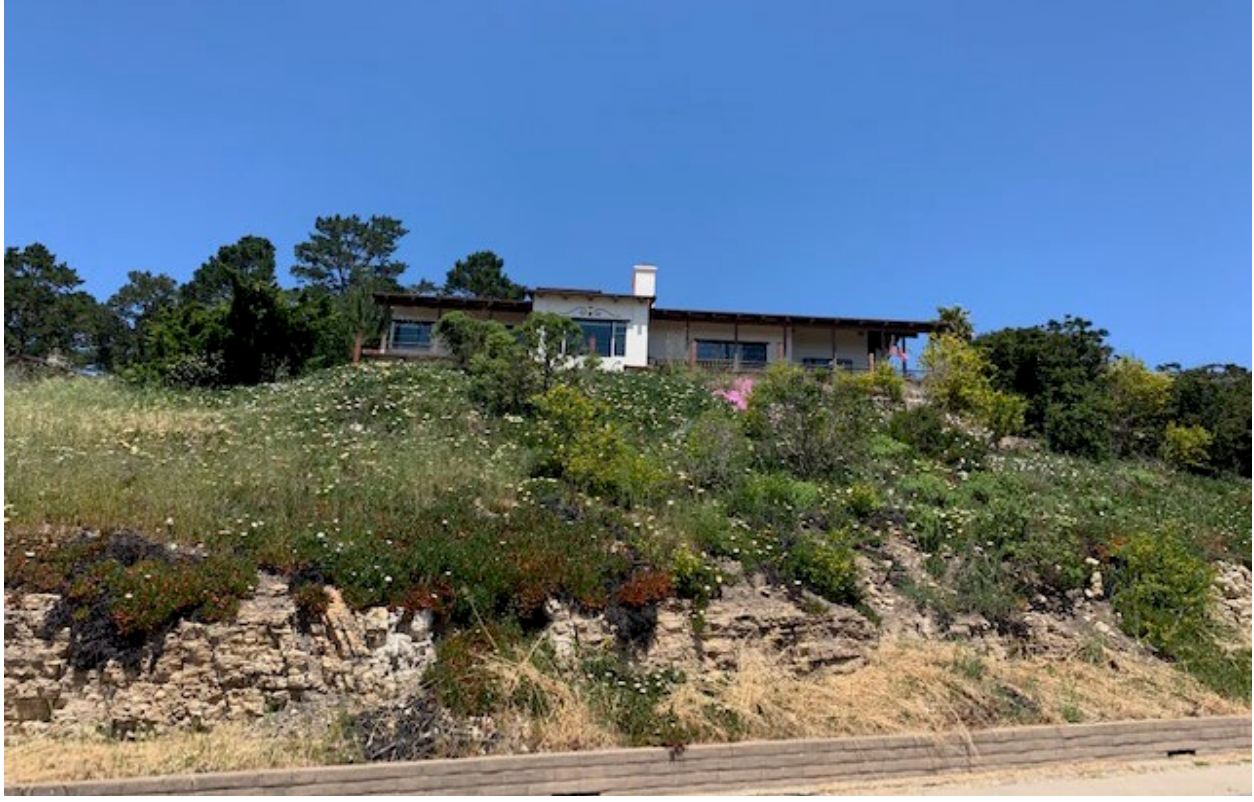
Figure 5 – Neighborhood