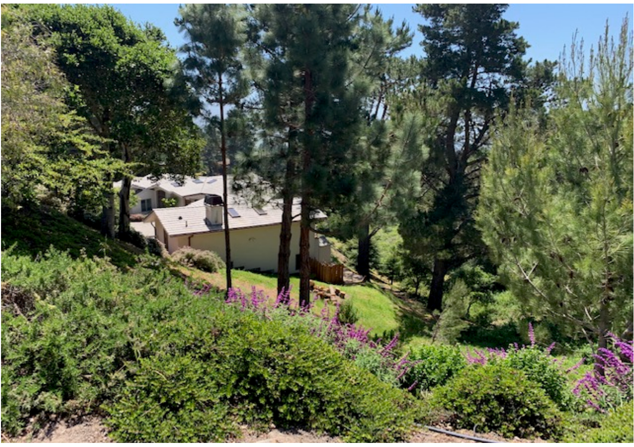
Figure 6 – Neighborhood