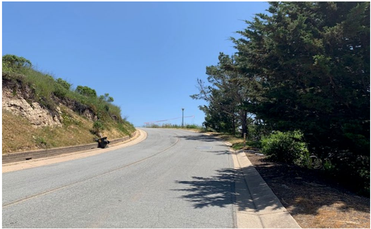
Figure 3 – View from Outlook Drive, facing southeast