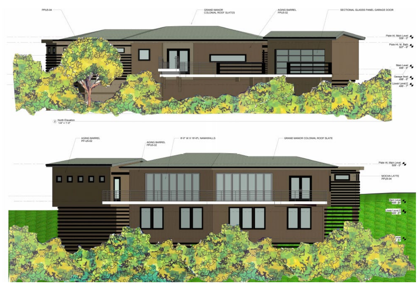
Figure 12 – Revised development with architectural accents and vegetated screening