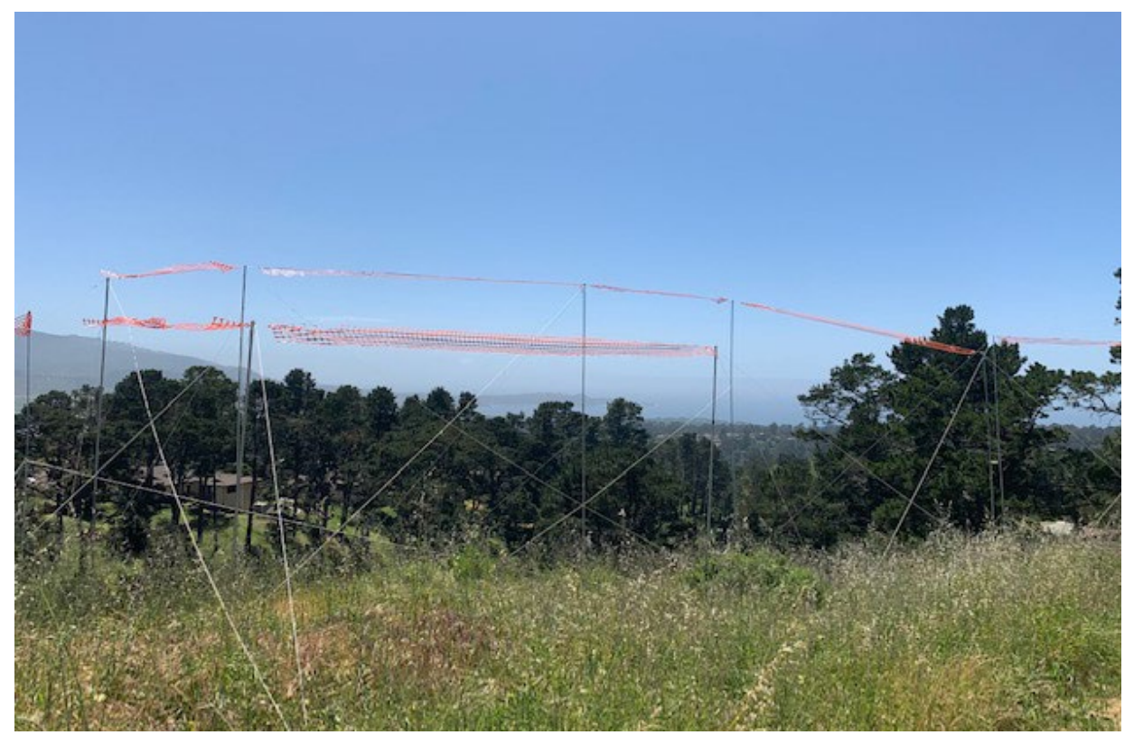
Figure 1 – View from Outlook Drive, facing southwest