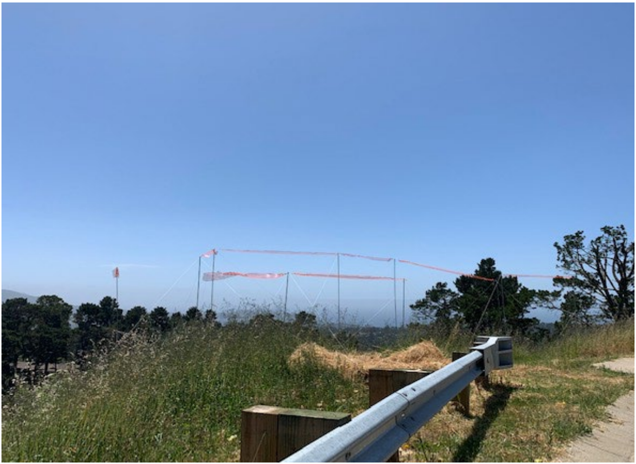
Figure 4 – View from Outlook Drive, facing northwest