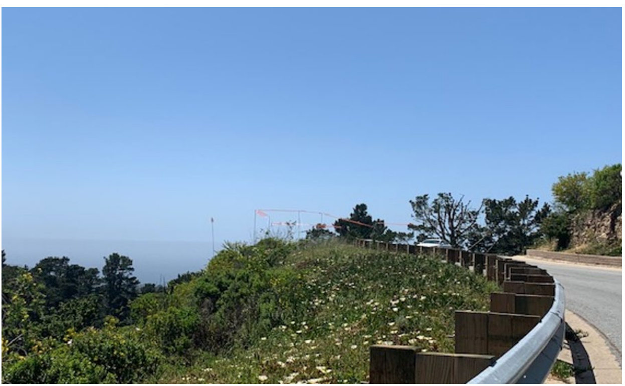
Figure 2 – View from Outlook Drive, facing west