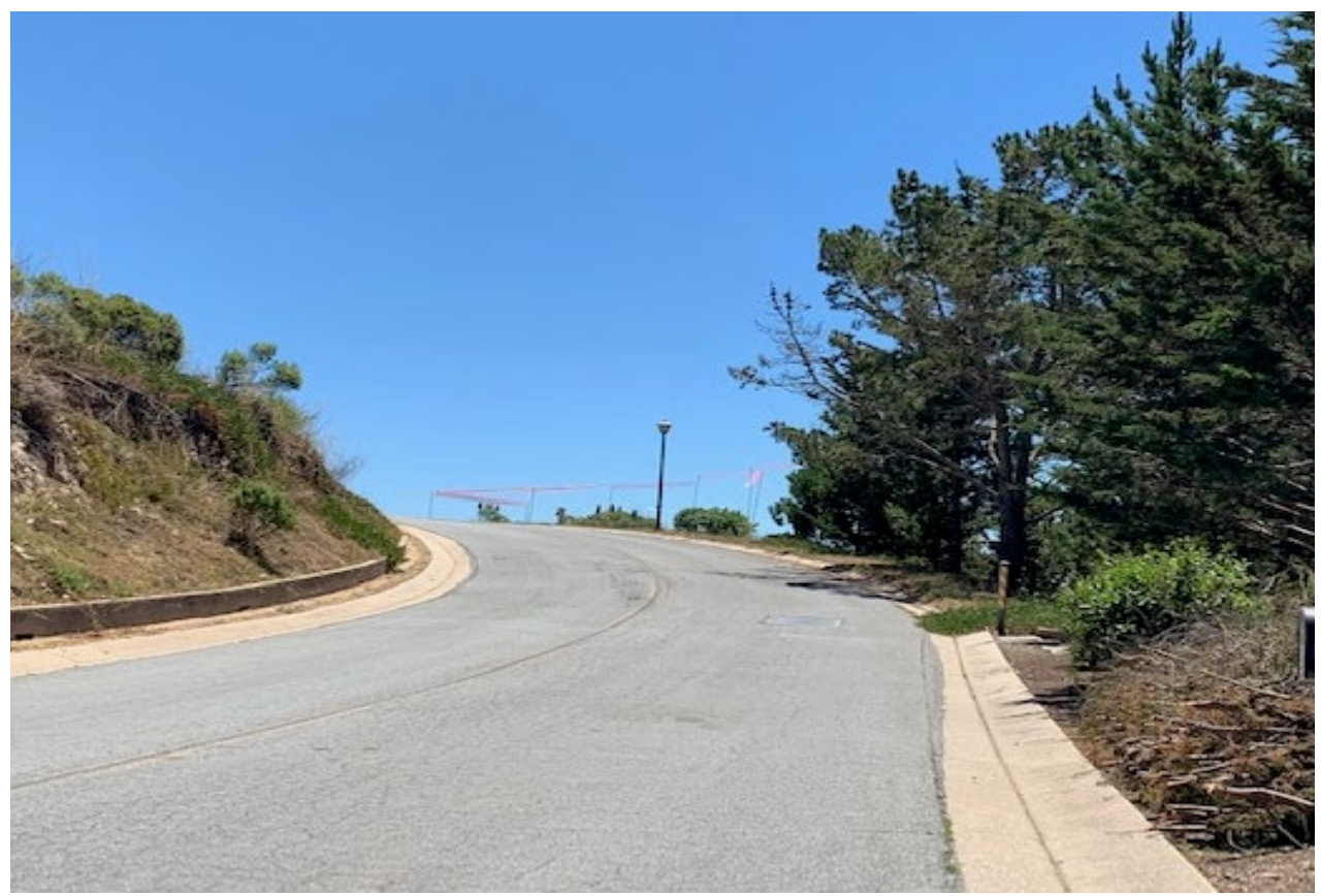
Figure 11 – Revised Staking and Flagging, view from Outlook Drive