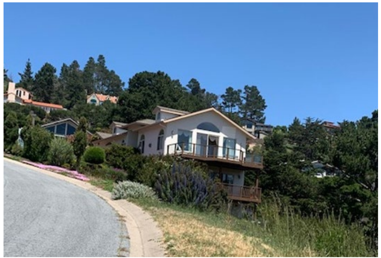
Figure 9 – Neighborhood home on stilts