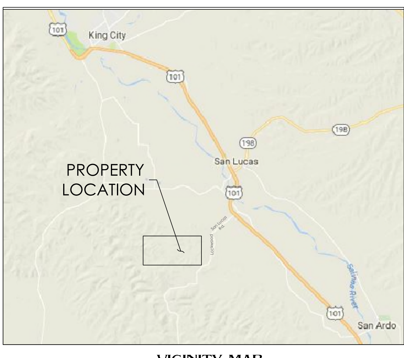
VICINITY MAP Not to scale