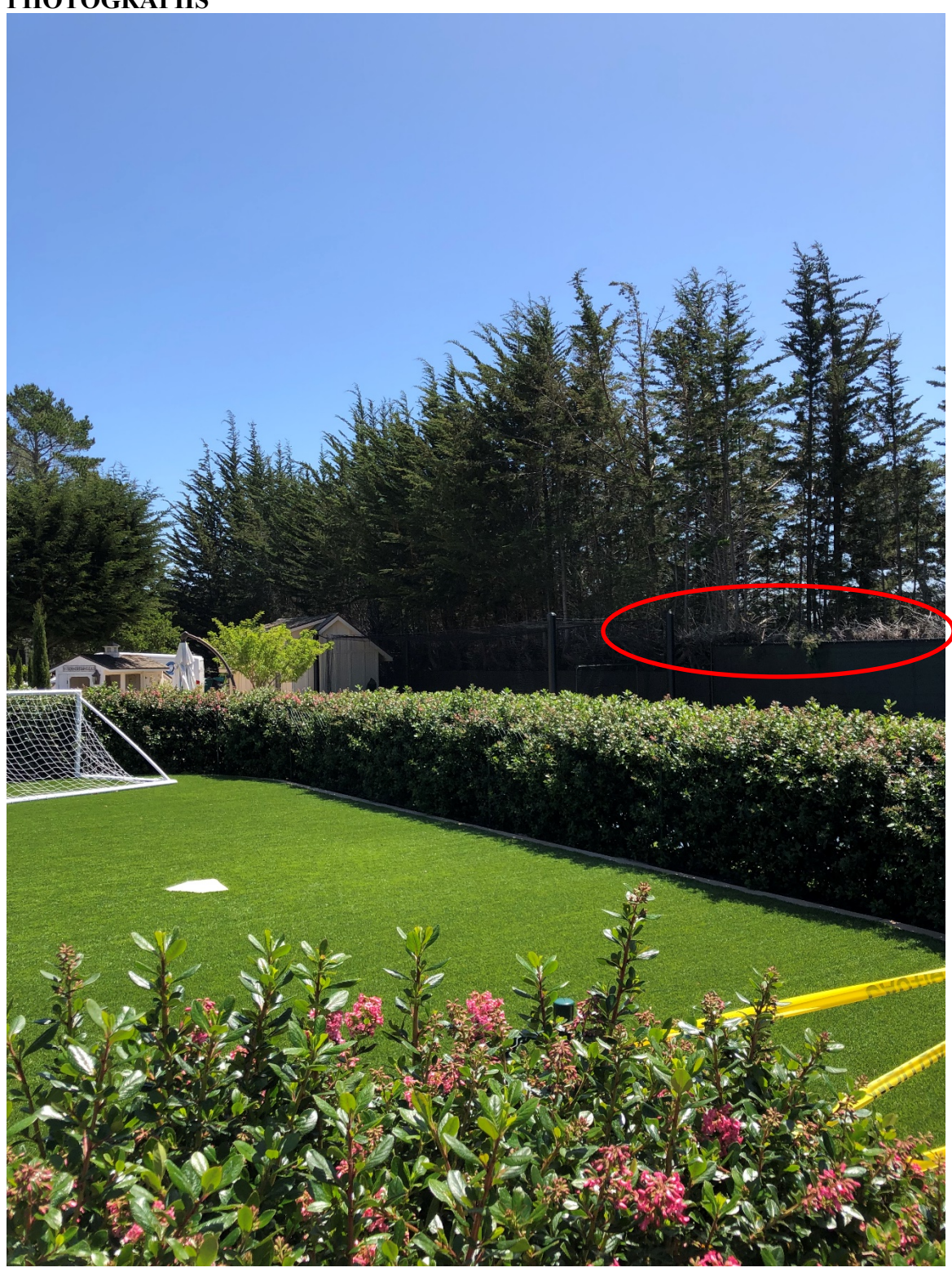
Area of disturbance