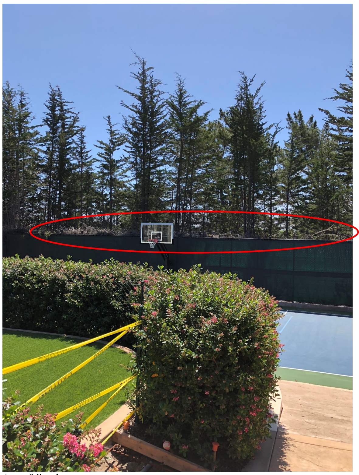
Area of disturbance