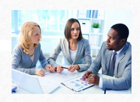
Revise & Review Program Policies