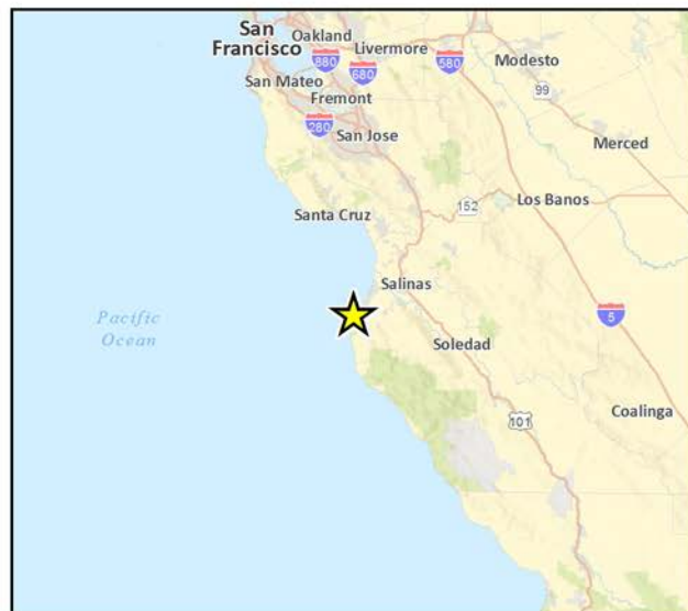
Fig 1 Regional location