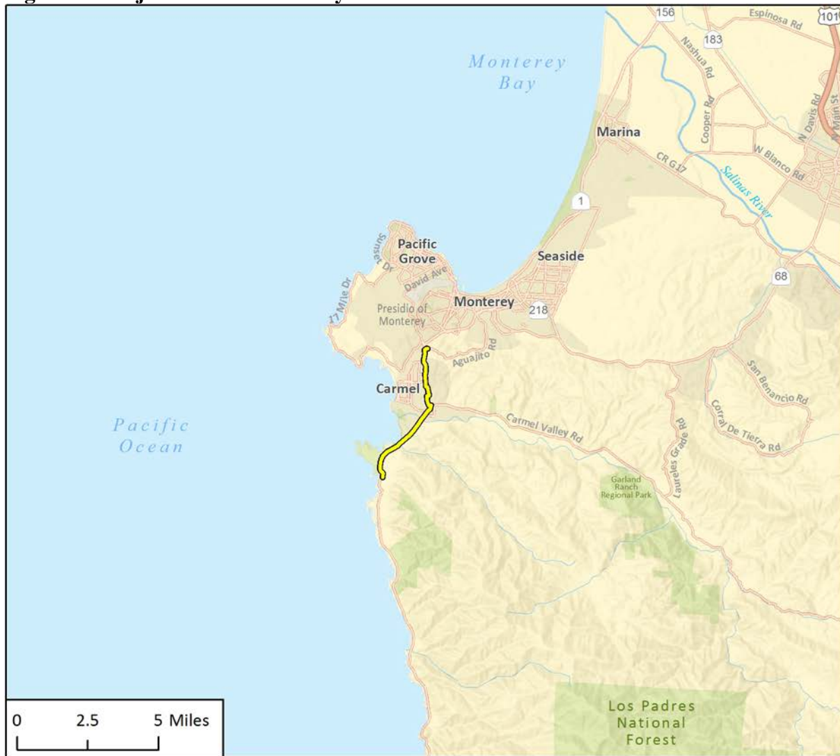
Figure 1: Project Area and Vicinity