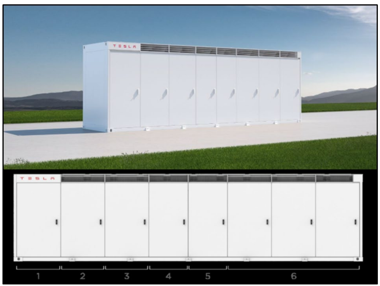
Figure 3 - Megapack Unit and Layout

off peak use times and dispersing that power back to the electrical grid for use during high peak use times. The Elkhorn BESS project will include continued use of the existing public utility operation for PG&E at Moss Landing Substation, and would enable PG&E to provide local area capacity and enhance electrical system reliability and flexibility at and around PG&E's Moss Landing Substation. Operation of the project is intended to reduce existing demand on natural gas power plants by allowing integration of renewable energy into the electrical grid through storage and use during peak need times.