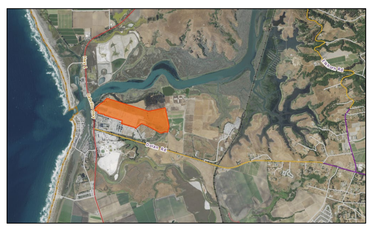
Figure 1 - Contextual Map: Subject Parcel Outlined in Orange

On August 31, 2011, the Monterey County Planning Commission approved a Combined Development Permit (Monterey County File No. PLN090274, Resolution No. 11-029) allowing the expansion of the PG&E Moss Landing Substation consisting of: the expansion and reconfiguration of existing 115 kV and 230 kV transformer banks, replacement of lattice towers with tubular steel poles, relocation of a microwave telecommunications tower, and the relocation of an outdoor test facility.