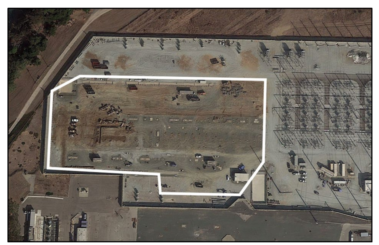
Figure 2 - Area of Proposed Development

The above referenced permit included the removal of the 115kV switchyard (see Figure 2). This is the area where a new Battery Energy Storage System (BESS) is proposed. The area shown in Figure 2 is approximately 4.5 acres in size. The property on which it is located is 147.77 acres, 42 of which contain development related to the existing PG&E substation. Development existing on the 42 acres includes gravel, asphalt, or pavement, associated energy structures/facilities, accessory structures such as offices, and a perimeter wall for security.