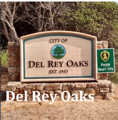
Del Rey Oaks