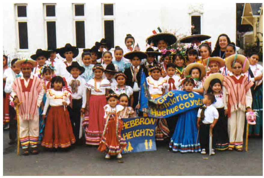
Celebrating local culture is an important aspect of the Salinas community