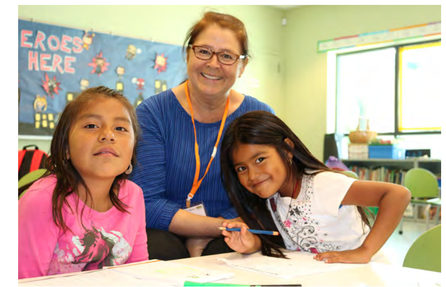
Homework help centers at the library serve many local youth

Support for specific park, recreation, and library system improvements varied between the Spanish and English language surveys. Respondents to the Spanish language survey were notably more likely to support improvements for nature/wildlife watching; playing soccer/lacrosse/football; skateboarding/BMX; homework help centers; makerspaces; and computer or technology labs.