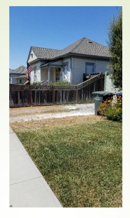
Most Side yard fences consistent