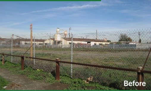
Serenity Park Watts