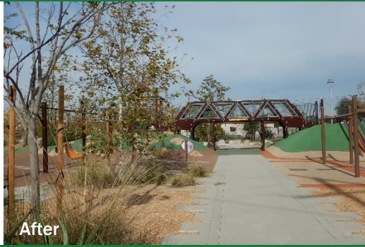
Rancho Las Flores Coachella