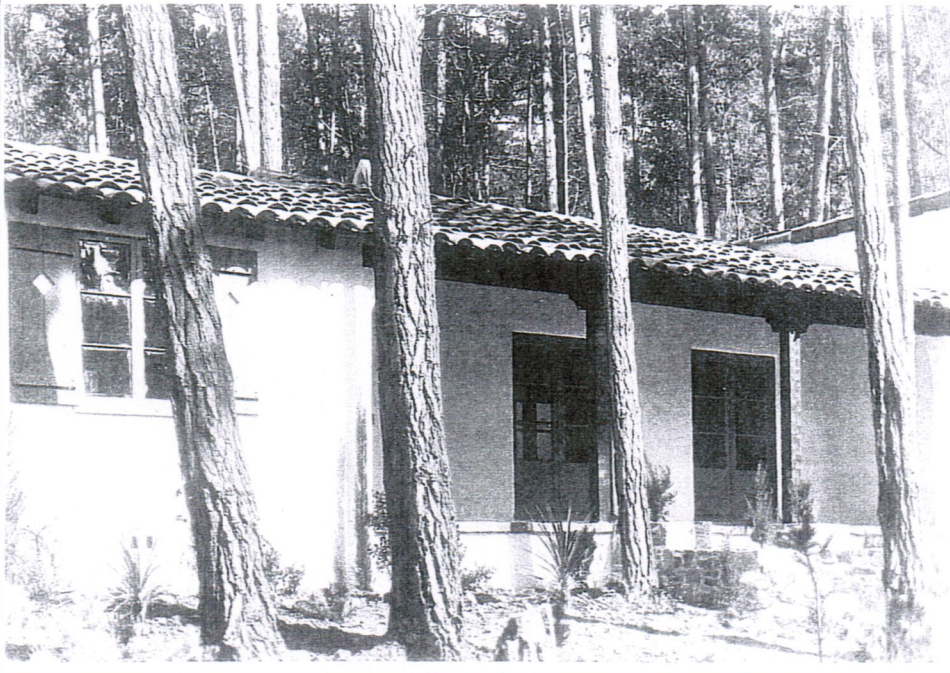
Supplemental Photograph or Drawing

Description of Photo: (View, date, accession#)