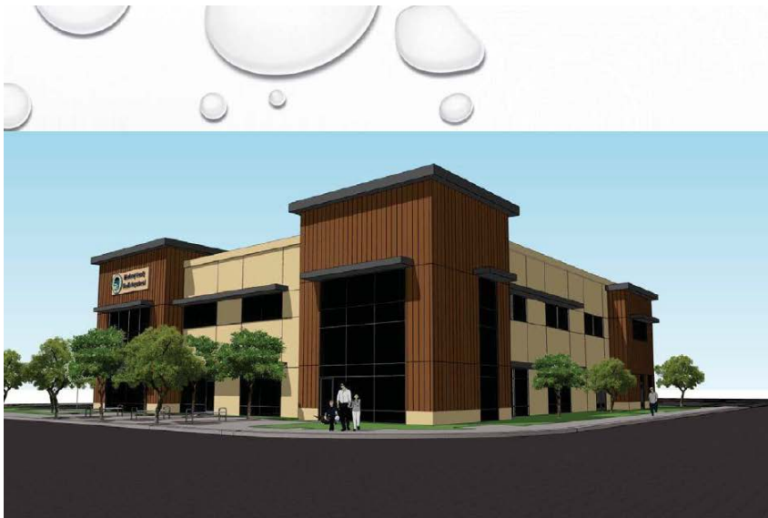
Perspective View 2