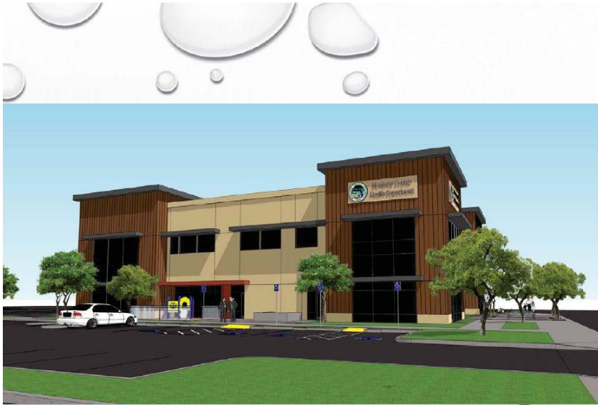
Perspective View 1