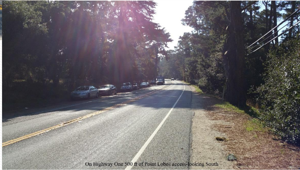
On Highway One 500 ft of Point Lobos access-looking South