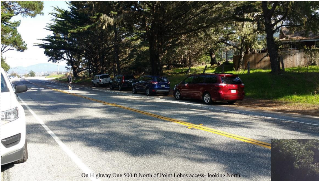
On Highway One 500 ft North of Point Lobos access- looking North