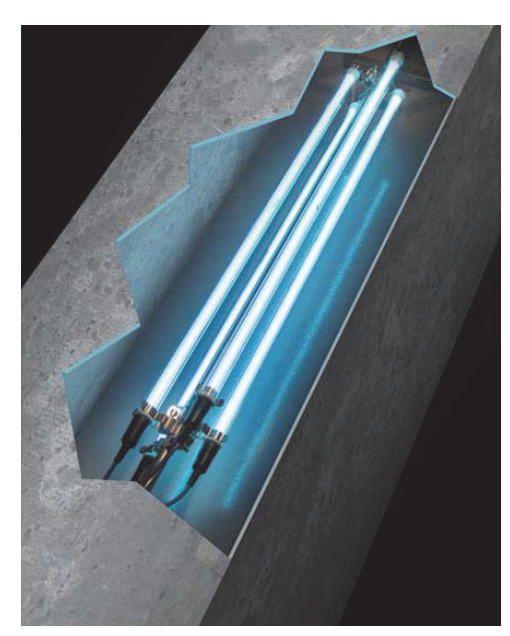
ODOR DESTROYER: Odor Exhaust Oxidation (OEO) system uses high-output UVV oxidation lamps to destroy odors as they exhaust to outside.

Care must be taken with high-output oxidation systems, noted Engel, as these produce ozone, which — along with other reactive oxygen species — should not be used within the envelope of the building, as the aggressive oxidizers may damage the sensitive plants.