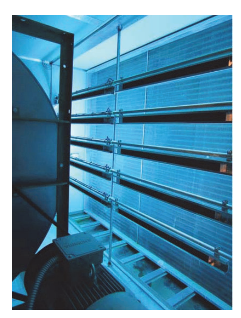
DISINFECTING WITH UVC: The APCO disinfection-odor control installed in the AHU disinfects and reduces odors with proprietary UVC and carbon ceramic lifetime tiles.