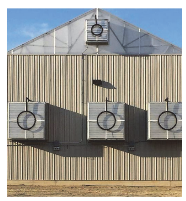
POINT OF SOURCE: The majority of Fogco systems utilize the point of source odor elimination concept, so they are incorporated into the operation of the exhaust fans of a facility.

Odor mitigation systems using neutralizers are also used in cannabis facilities, and they can typically be classified into two different categories: perimeter treatment of a facility or point-of-source treatment of the odor, said Wintering. Perimeter treatment includes an oil-based neutralizer that is used with either a water-based evaporative system or a water-based high-pressure fog system. Point-of-source systems involve air filtration combined with water-based high-pressure fog and an oil-based neutralizer.