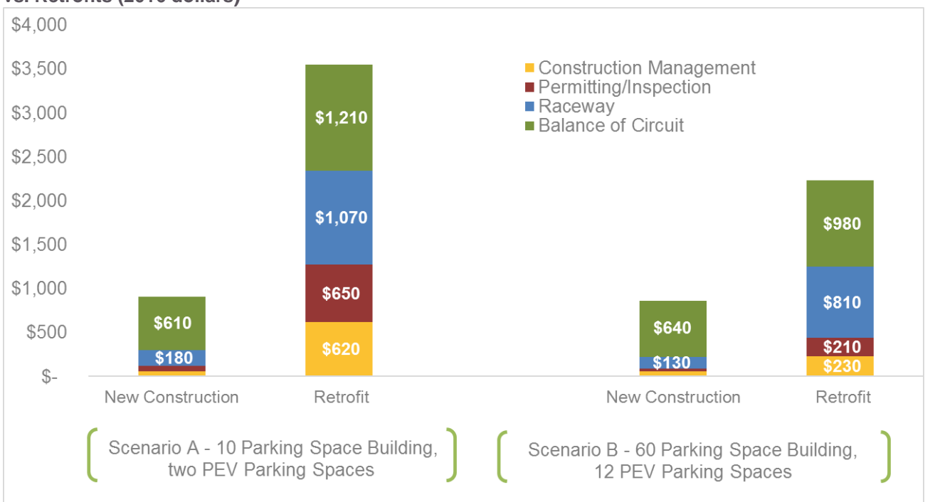
Figure 3. Relative Cost per PEV Charging Space of PEV Charging Infrastructure in New Construction vs. Retrofits (2016 dollars)

The results indicate that applying PEV-charging infrastructure building codes to building alterations would also provide potential cost savings. For instance, installing underground raceways during parking area expansion or renovation could potentially achieve much or all of the cost savings for conduit installation during new construction. Requiring that new electrical service panels contain capacity for PEV charging could similarly avoid significant costs for retrofitting expanded electrical service later. Data from the Construction Industry Research Board indicates that alterations and additions represent about 21% of the value of permitted construction for both residential and