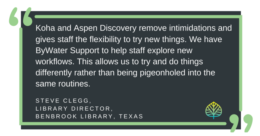
What to Expect When Implementing Aspen Discovery:

Aspen is a full-featured Discovery System that integrates with e-content and other 3rd party providers, giving your patrons comprehensive access to all of your materials in one place. Aspen combines your library catalog with e-content, digital archives and enrichment from all major third party providers, improves relevancy and ease of use, provides native reading recommendations, displays all formats of titles within one result (FRBR) and much more. Aspen was created to give users an improved experience over other Discovery systems with less of an impact on library budgets.