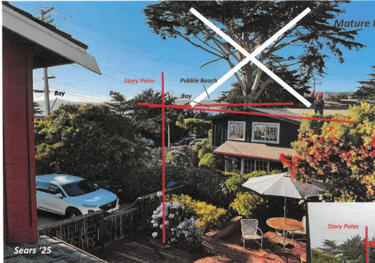
LOOKING NORTH SECOND FLOOR BALCONY 2472 BAY VIEW AVENUE