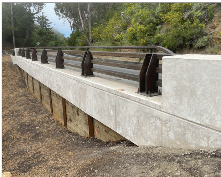
Soldier Pile Wall with Colored Piles and Untreated Timber Lagging