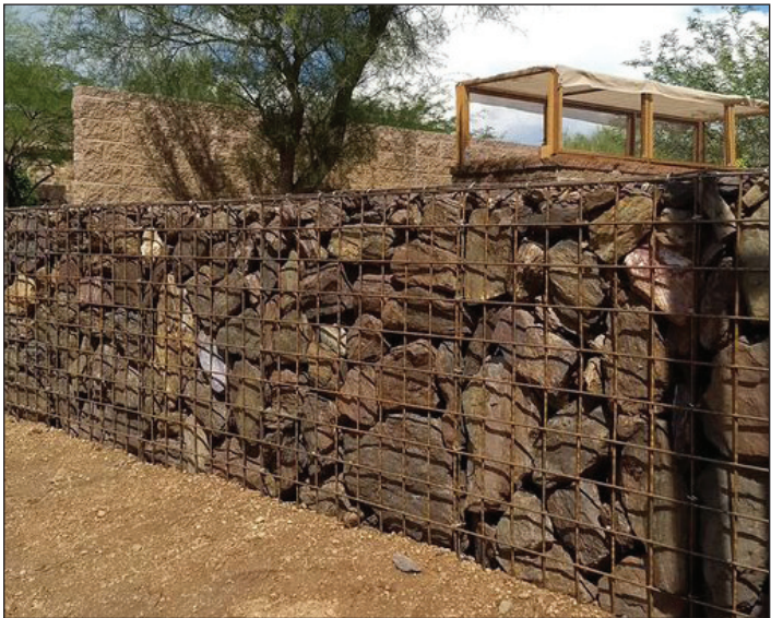
Stained Gabion Baskets with Dark Stone