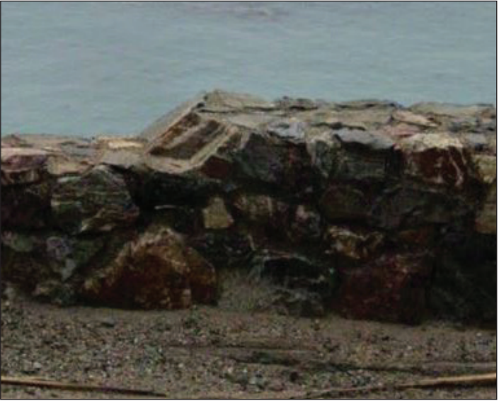
Native Stone Barrier Overlooking China Basin Beach at PM 26.72

Stain shall be applied to gabion baskets. Stone color shall complement the local geology and should be dark in color.