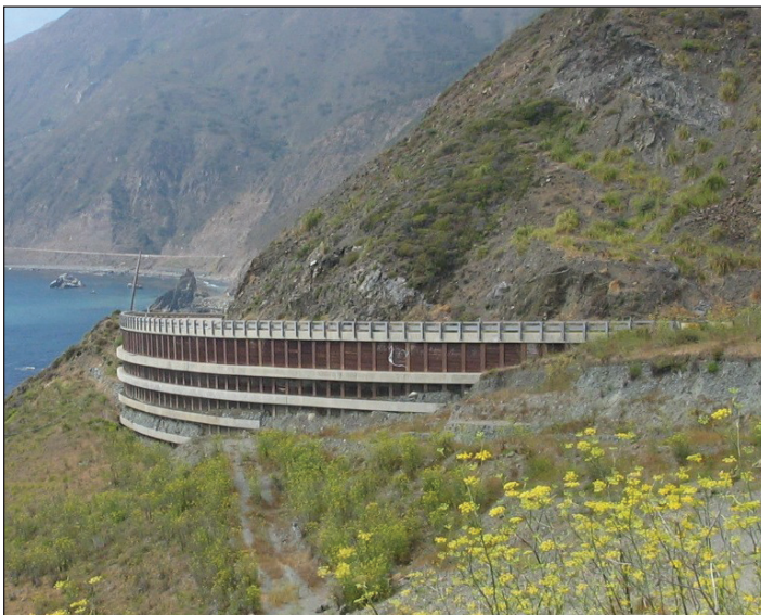
Soldier Pile Wall with Integrally Colored Coping and Walers