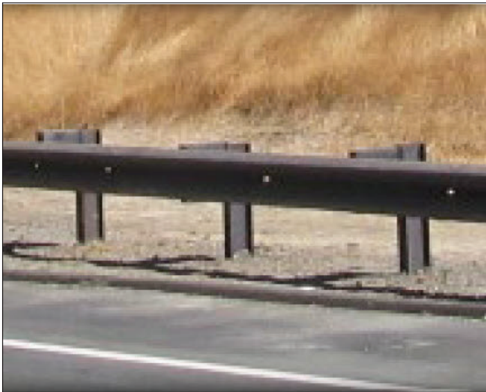
Stained Posts and Guardrail