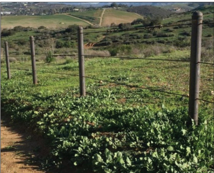
Stained Cable Railing

Stain shall be applied to exposed galvanized surfaces to reduce reflectivity and provide a natural brown color. This includes, but is not limited to, cable railing, gabion baskets, galvanized drainage components, posts, and guardrail.