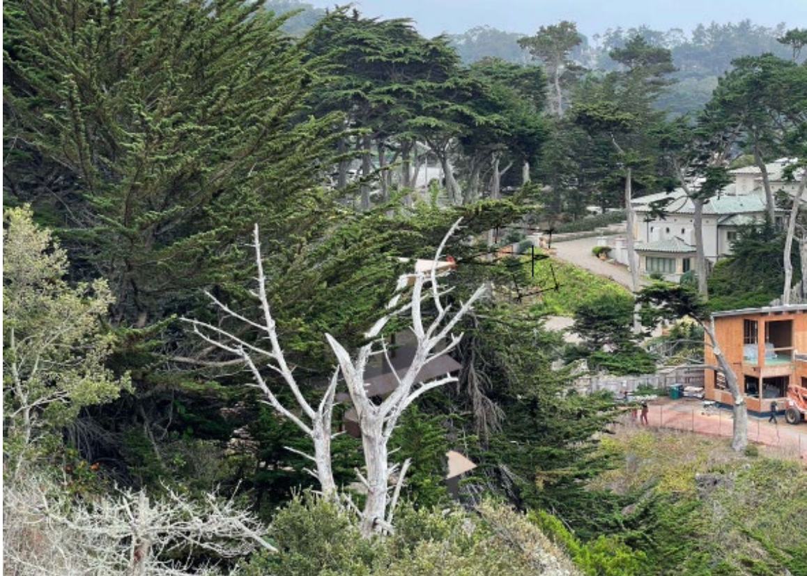
Figure 4: Photo-simulation View from Vista Point to the North.