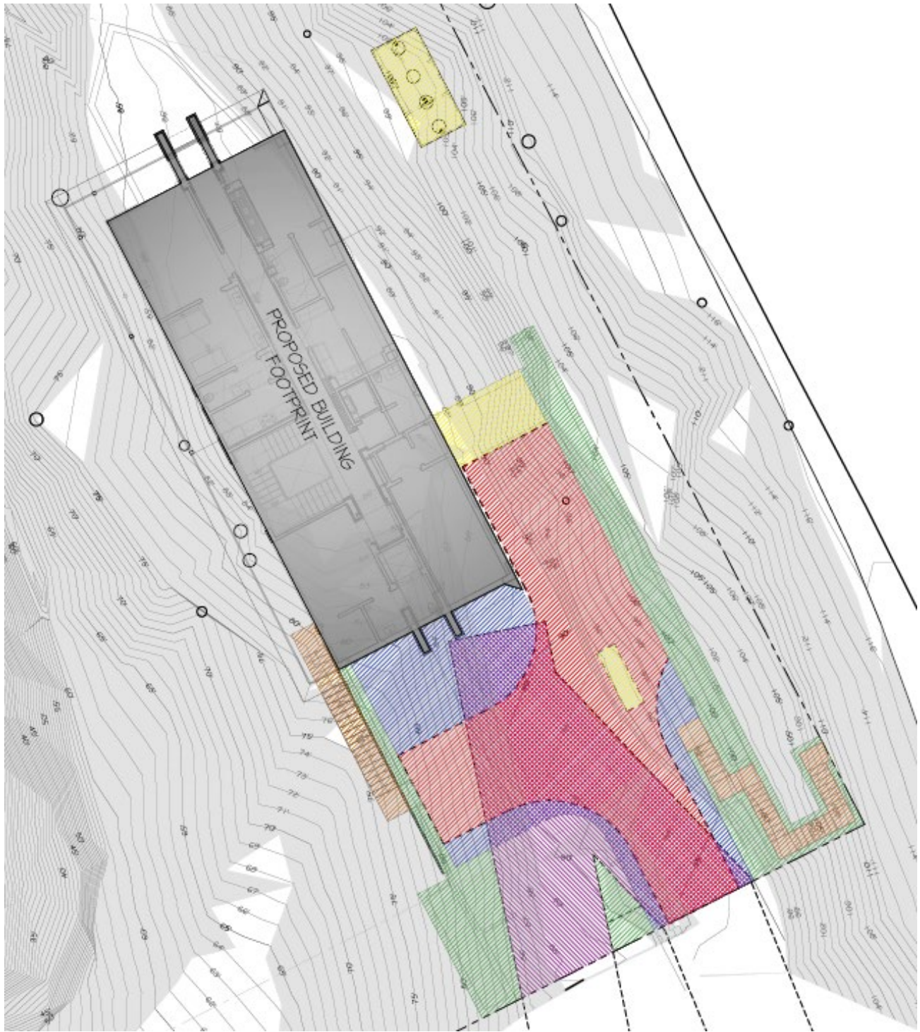
Figure 2: Color Coded Site Improvements Diagram of the proposed project.

Another section of the CIP pertaining to development on slopes is section 20.146.120.A.6, which states that as a condition of development approval, all areas of a parcel containing slopes of 30 percent and greater shall be required to be placed in a scenic easement. In accordance with this policy, Condition No. 12 is recommended, which would place a conservation and scenic easement over those portions of the property exceeding 30 percent. The intent is that the