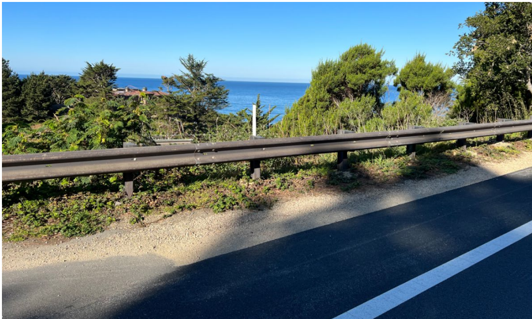
Figure 3: Revised Photo-simulation View from Highway 1.

LUP Visual Access Policies 5.3.3.4.a and 5.3.3.4.c require that visual access to the shoreline from major viewing corridors be protected for visitors and residents alike, and that structures and landscaping installed west of Highway 1 be sited and designed to retain public views of the shoreline and roads. The proposed residence would not obstruct views of the rocky promontories and bluffs along the shoreline that are currently visible from the vista point and Highway 1. The proposed natural, earth-toned colors and materials are compatible with the distant rocky cliffs, which help the residence be compatible with the natural landscape. Although the proposed structure would be heavily obscured from view by existing trees, it would be partially visible from the overlook. However, from the same overlook/vista point, when looking southwest beyond the proposed project, trees, access roads in the neighborhood, and other residences would all be prominently visible. Thus, the proposed project would be consistent with the existing natural and built environment, would not degrade the surrounding visual character of the area, and would not detract from the natural beauty of the scenic shoreline (LUP Policy 2.2.3.1).