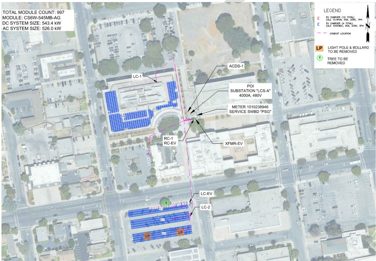
Figure 1 – Civic Center