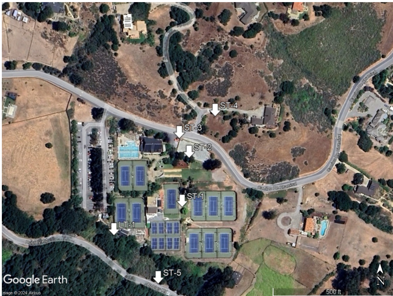
FIGURE 1: AMBIENT NOISE MEASUREMENT SITES