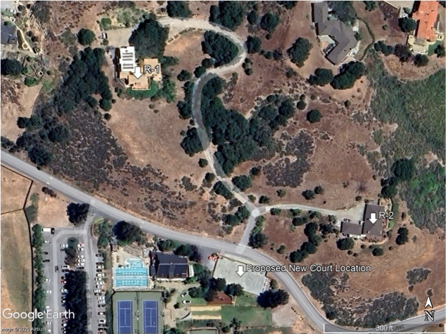
FIGURE 1: LOCATIONS OF NEW COURT AREA AND CLOSEST EXISTING RESIDENCES