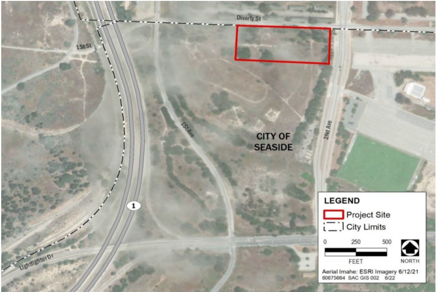
Diagram Depicting Monterey County Courthouse Site