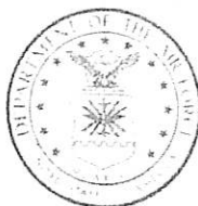
CHIEF OF STAFF MARK A. WELSH III, GENERAL, USAF

Handwritten signature of Mark A. Welsh III in black ink.