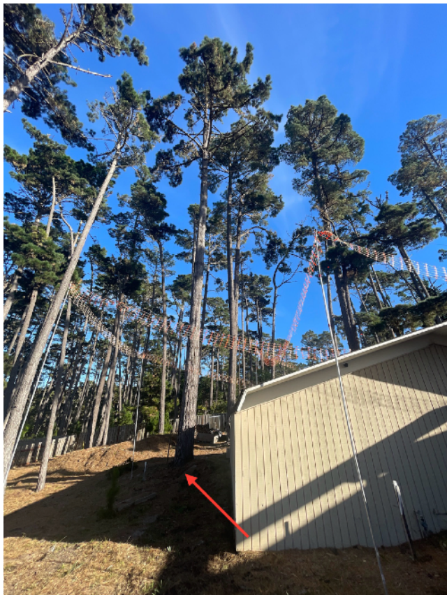
053-retain with safety pruning and continued monitoring. No impacts to roots are noted.