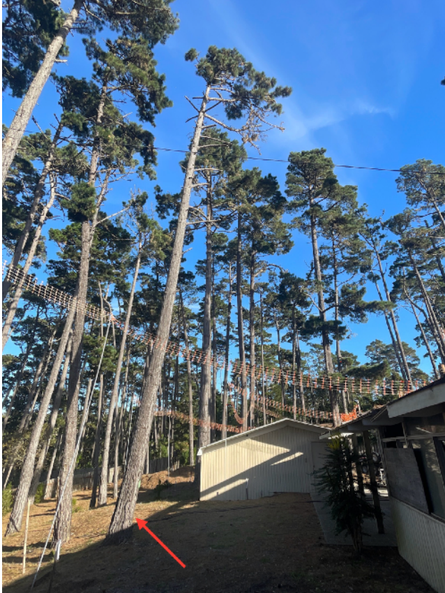
054-remove. within project boundary. decline with lean over structure.