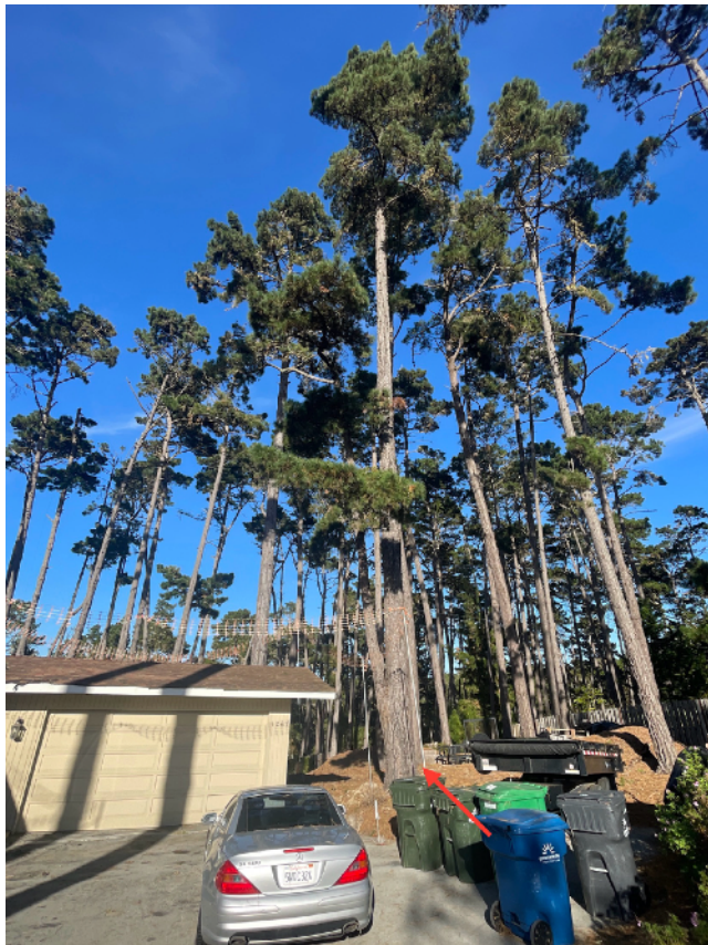
052- retain with minimal root pruning. Continue to monitor.