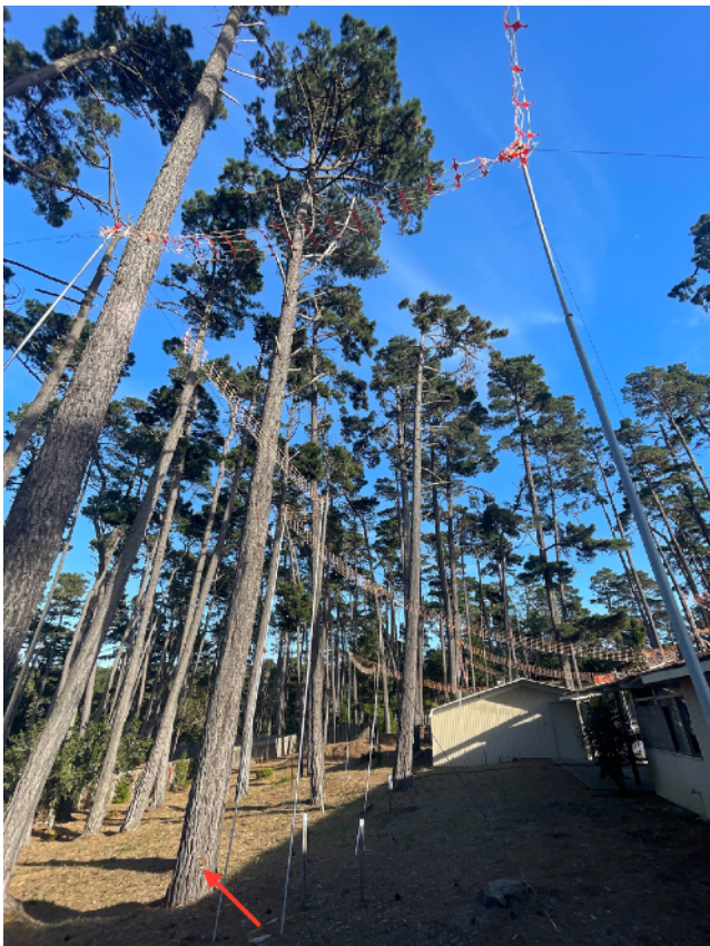
055-remove. within project boundary. decay present in trunk