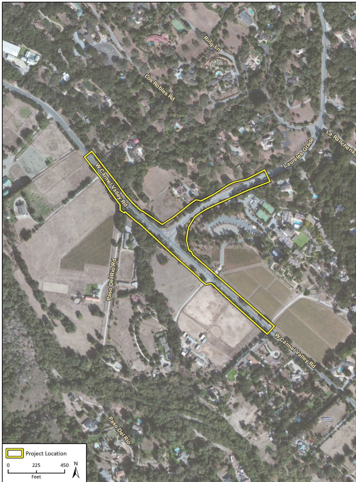
Figure 2 Study Area