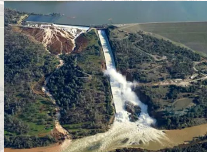
Photos of Oroville Spillway Failure 2017