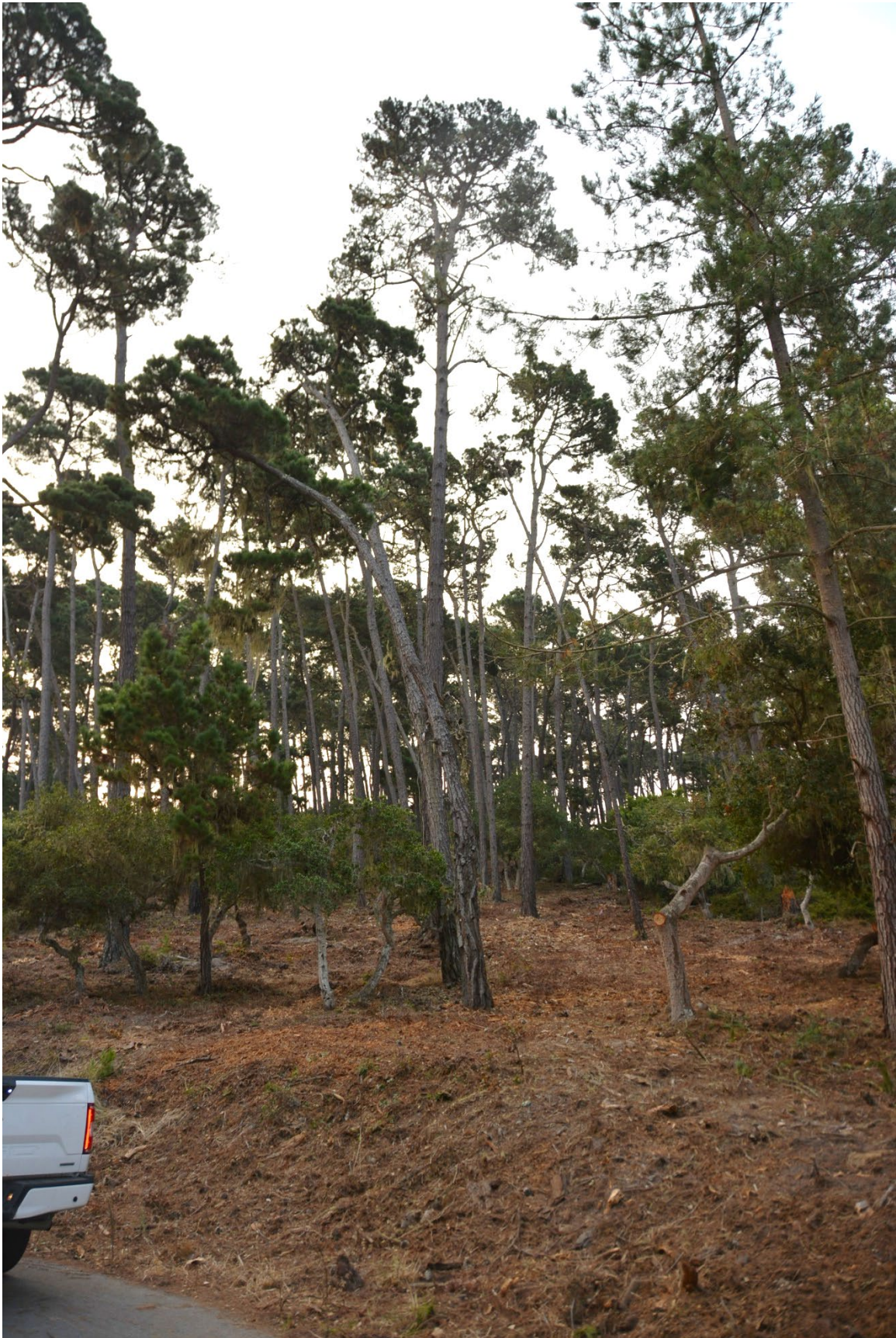
View upslope to the southeast, most the trees are tall, spindly, and weak