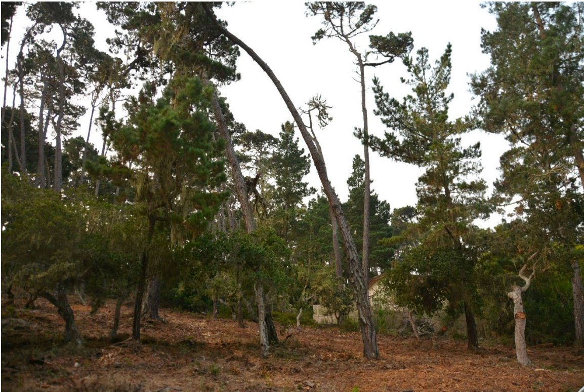
View of the site to the south