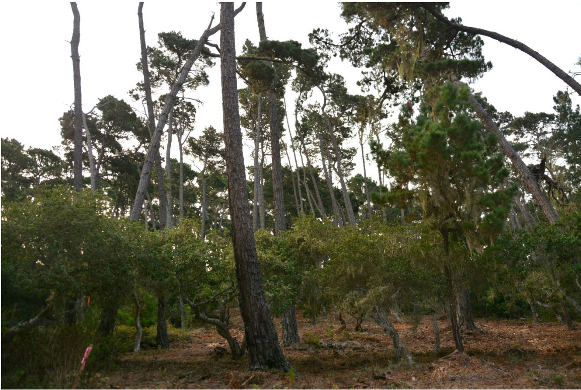
View of the site to the southeast