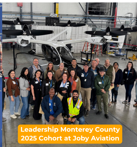
Leadership Monterey County 2025 Cohort at Joby Aviation