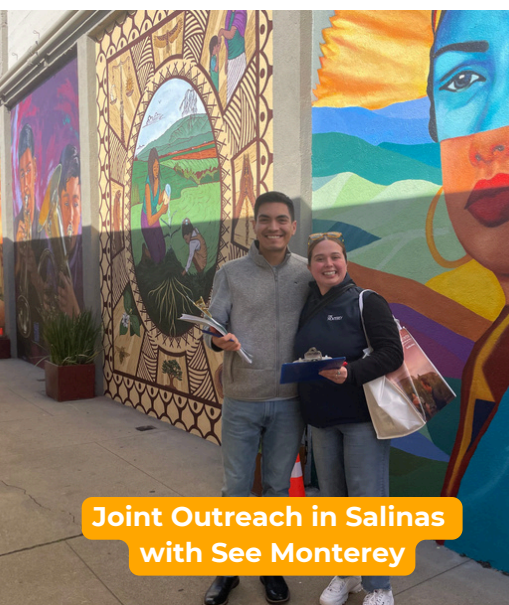
Joint Outreach in Salinas with See Monterey