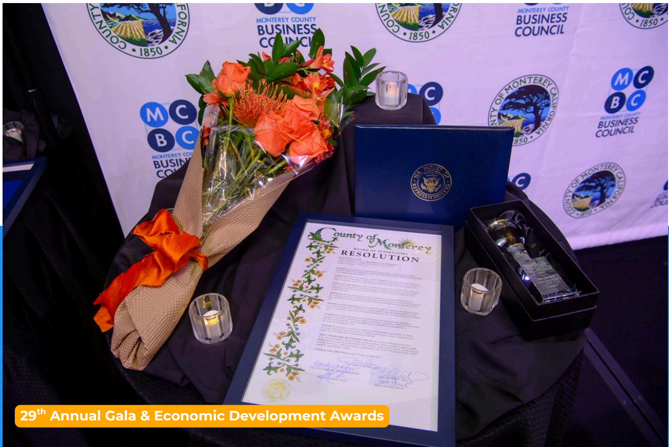
29 th Annual Gala & Economic Development Awards