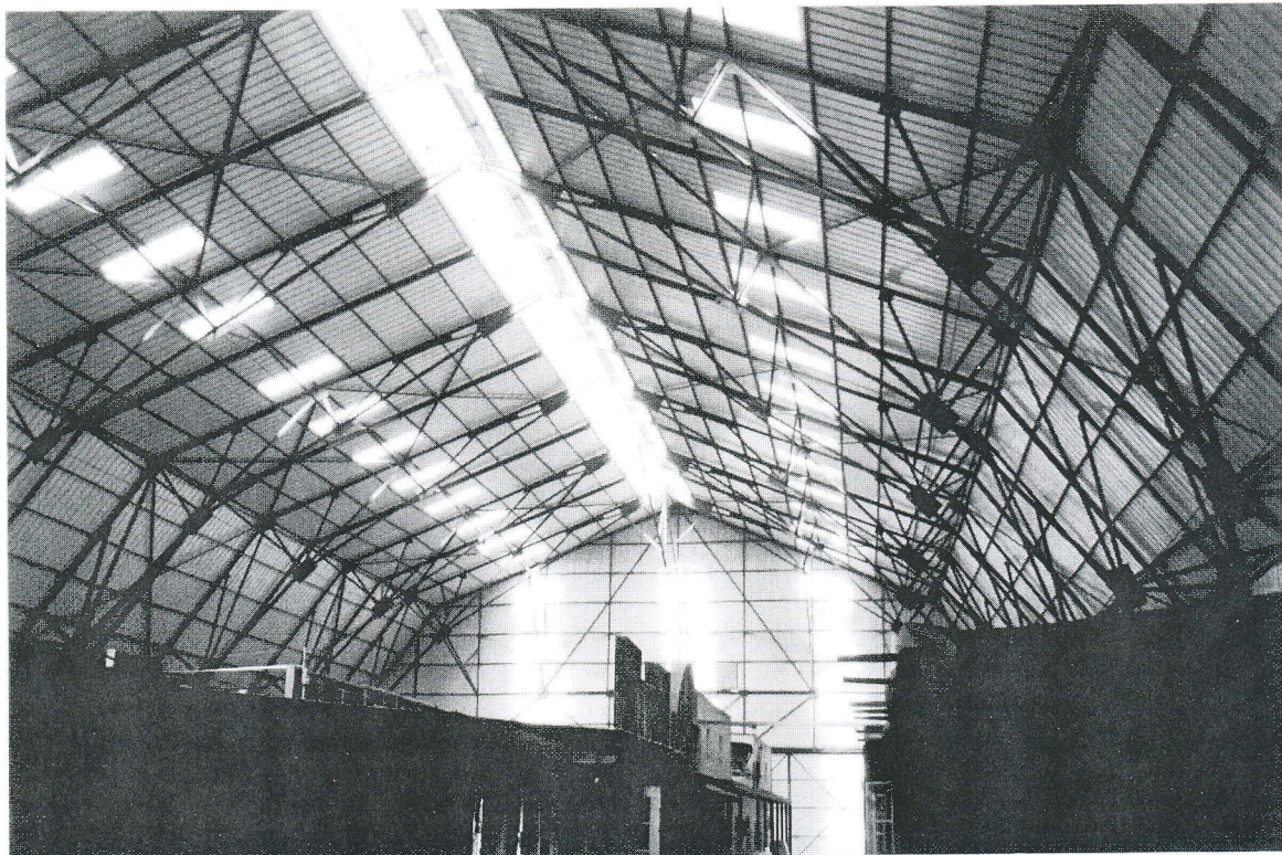
Ellingwood Hay Co. Barn interior. Note steel three-hinged arched truss framing system. October, 2009.