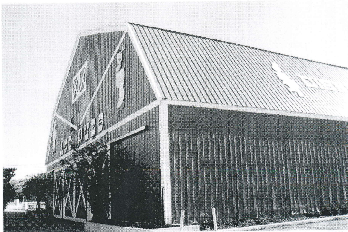
Looking NE at the west facing facade of the Ellingwood Hay Co. Barn. Note applied wood trim and decoration. October, 2009