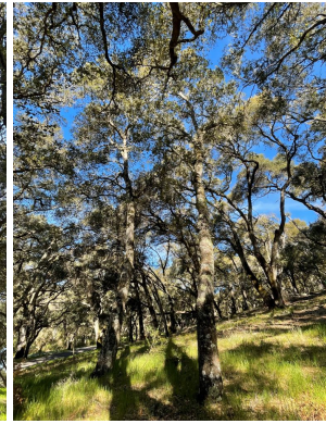
Trees #5 & #6