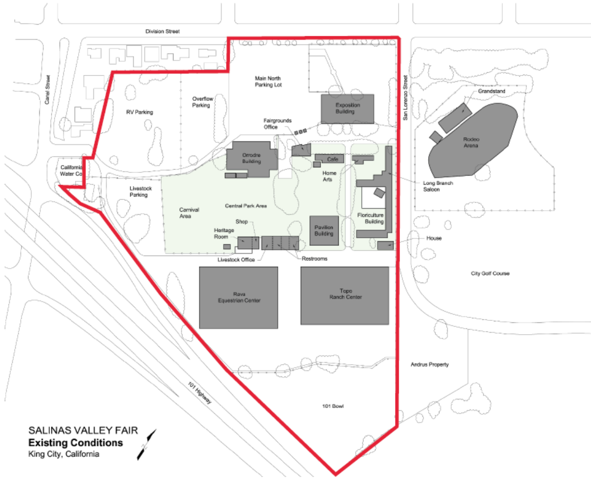
Exhibit A SALINAS VALLEY FAIRGROUNDS